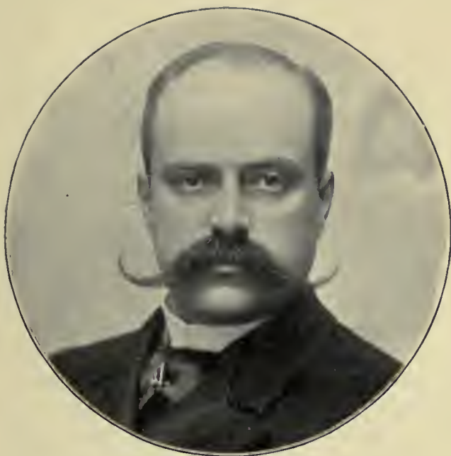
PRINCE VICTOR NAPOLEON. The present Bonapartist Claimant. Oricelly, Paris.